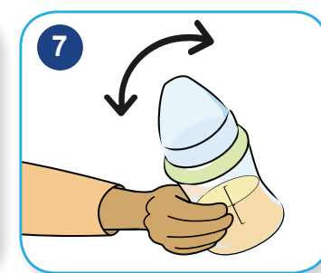
Shake the bottle until no lumps of powder are left.