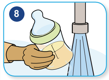
Quickly cool the bottle of formula under cold, running water or in a container of cold water. When it is at body or room temperature, feed your baby.