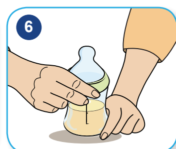
Tighten the ring with your hands.