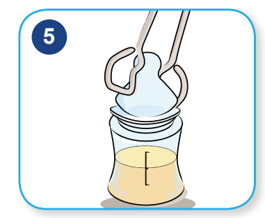
Pick up nipple, cap and ring with sterilized tongs and put on bottle.

Add the powder to the sterilized hot water.