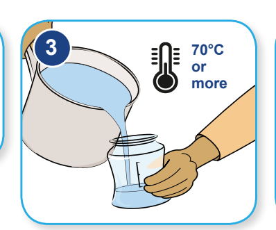
Check the expiry date on the can.

For healthy babies, sterilized water cooled to room temperature can be used as long as the formula is fed immediately.