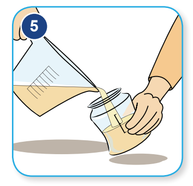
Add an equal amount of formula for one feeding into the sterilized bottle.