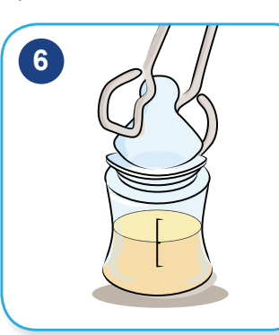
Use sterilized tongs to pick up nipple, ring and bottle cap.

Throw out formula that your baby doesn't drink after 2 hours.