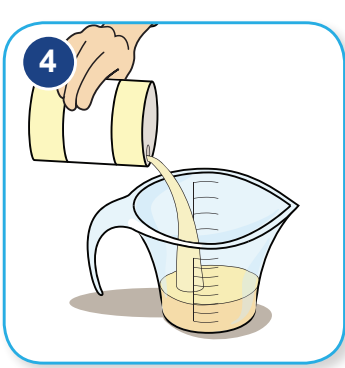
Measure an equal amount of formula for one feeding.

Pour and measure sterilized water that has been cooled down to room temperature into a sterilized bottle.