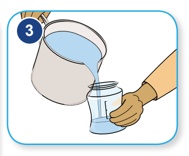
See <u>Tip Sheet #2</u> on how to sterilize the water used to make formula.

Shake the can well and open with a sterilized can opener.