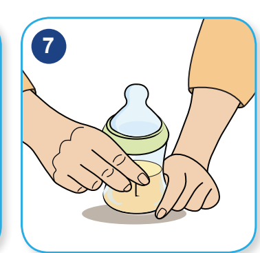
Tighten the ring with your hands. Be careful not to touch the nipple with your hands.